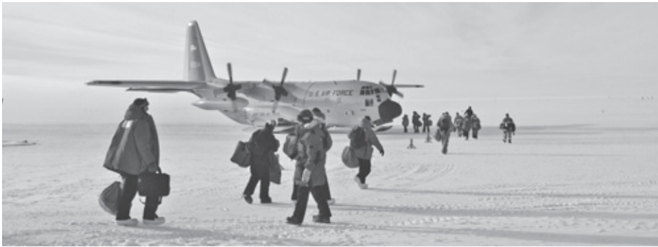
A plane flies team members home from the camp.

107 Scientists work as part of the team to learn more 117 about the Antarctic. Each scientist conducts a different 125 project. Some study the animal and plant life. Some 134 study the climate and weather. Some study the glaciers.