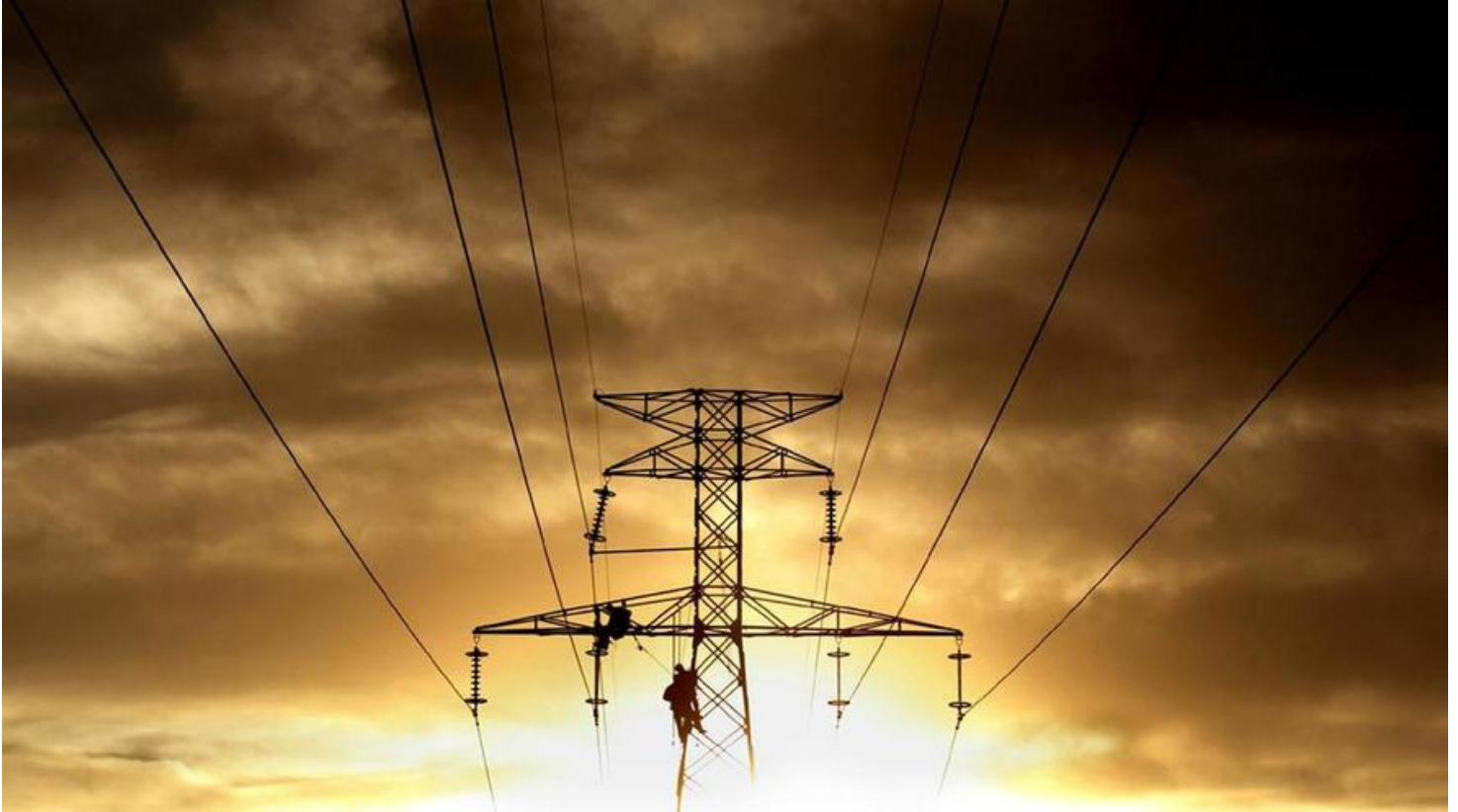
Image 1. Workers climb an energy tower to remove a glass insulator on the outskirts of Mendoza, Argentina, in 2003. They will replace the old insulator with a new, organic one.

Materials that conduct heat or electricity are known as conductors. Materials that do not conduct heat or electricity are known as insulators. Insulators and conductors have many useful functions.